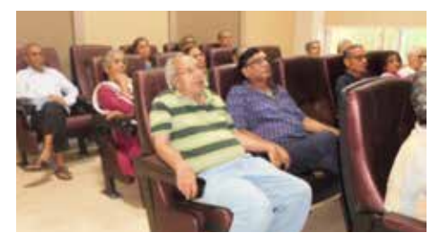
Ayurvedic presentation by Apollo at Ashiana Utsav. Lavasa