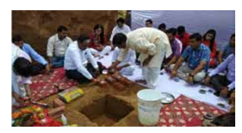
Bhoomi pujan of Bal Bharti School. Ashiana Town. Bhiwadi

More than 500 flats have been handed over to customers in Ashiana Town- \beta , Bhiwadi . That's a score of over 80 percent. Quality control checklists of all sold flats in Ashiana Town- \beta have been released. The quality of construction of the flats and their Wow factor has received high ratings from Ashiana Town- \beta customer feedback.