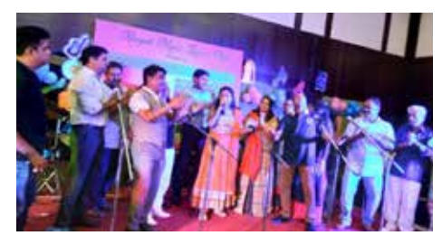
Musical session at Rangoli Gardens, Jaipur

Ashiana organised a musical session at Rangoli Gardens, Jaipur with the RWA and Music Lover's Club on the occasion of World Music Day. More than 400 residents enjoyed the music.