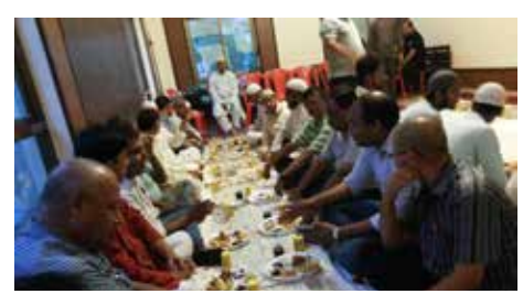
At the iftar party organised by residents of Ashiana Brahmananda, Jamshedpur