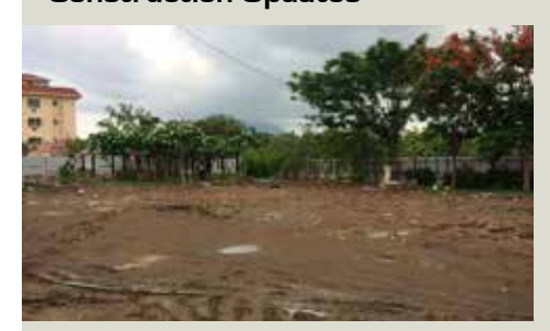
Land levelling for new development at Ashiana Navrang, Halol

At Ashiana Navrang, Halol, all 240 units in Phase 1 and 2 are now ready and the land area for the start of a future development is levelled and ready. The sales office has been shifted to the Club House.