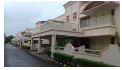
Ashiana Woodlands executive flats after repainting of exteriors

To retain both beauty and building health, exterior repair and painting work has started at Ashiana Woodlands , Jamshedpur .