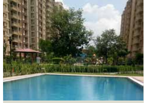
Swimming pool at Anantara, Jamshedpur