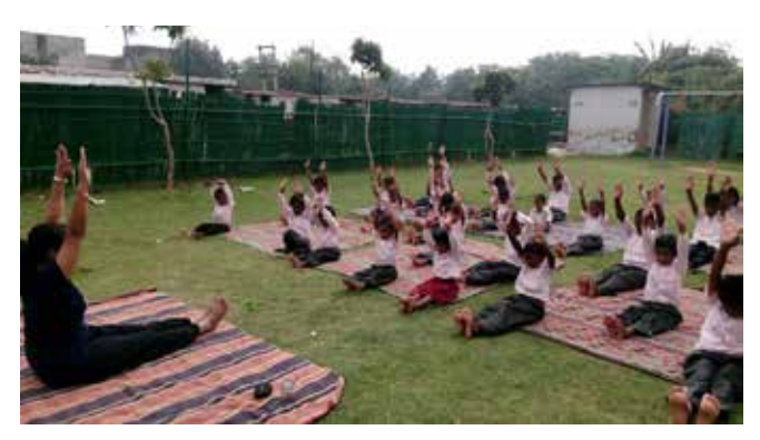
Phoolwari children at Ashiana Town-3, Bhiwadi presented handmade photo frames and floral bouquets to their mothers on Mother's Day and, (right) practiced yoga asanas outdoors on International Yoga Day