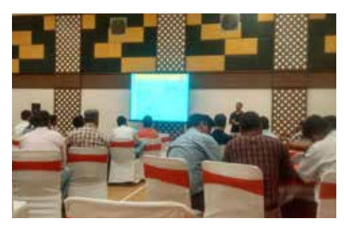
Customers listen to the CLSS presentation at Ashiana Town-β, Bhiwadi

At Ashiana Town-B. Bhiwadi. PMAY CLSS Education Sessions are taken very seriously. The entire team has been explaining this government scheme to customers and resident tenants in great detail - the categories and the criteria, so that they can make their decisions in an