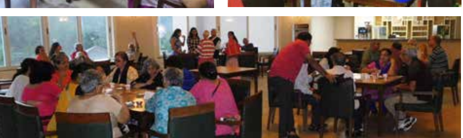
Month End Party at Ashiana Utsav, Lavasa