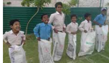
Outdoor sports activities at Ashiana Town-B, Bhiwadi included tug-of-war and sack racing