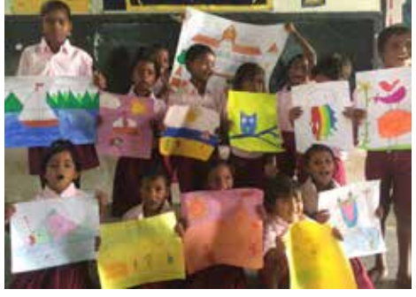
Funfilled drawing and craft activities at Phoolwari schools on Father's Day