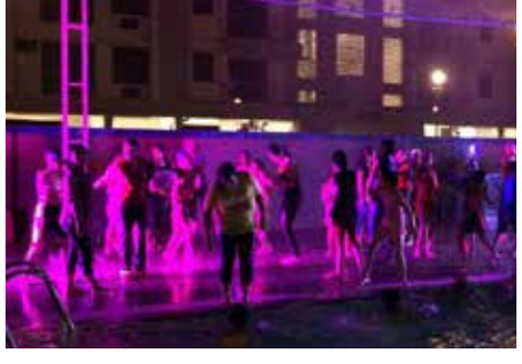
A lively rain dance was organised at Ashiana Town-β, Bhiwadi

Handing over of Aries is in full swing at Ashiana Anantara , Jamshedpur . More people are moving in adding to the 165 families already there.