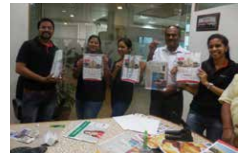
Paper bag making at Phoolwari, at Utsav, Lavasa and Bhiwadi on Environment Day