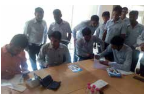
Workers and their children at medical health camp, Rangoli Gardens, Jaipur

checks to assess overall health under the supervision of the Saket hospital team. More than a hundred staffers attended the interactive session on cleanliness and hygiene.