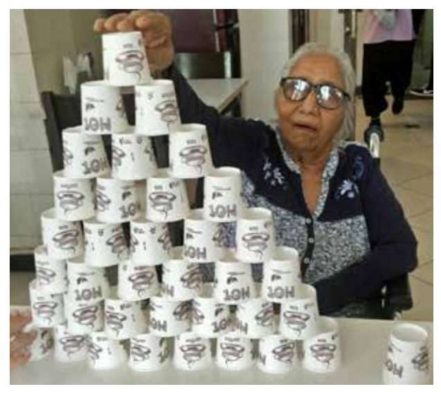
Crafts and clay activities at Care Homes, Bhiwadi