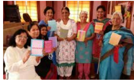
Residents with their handmade note books at Ashiana Utsav. Bhiwadi