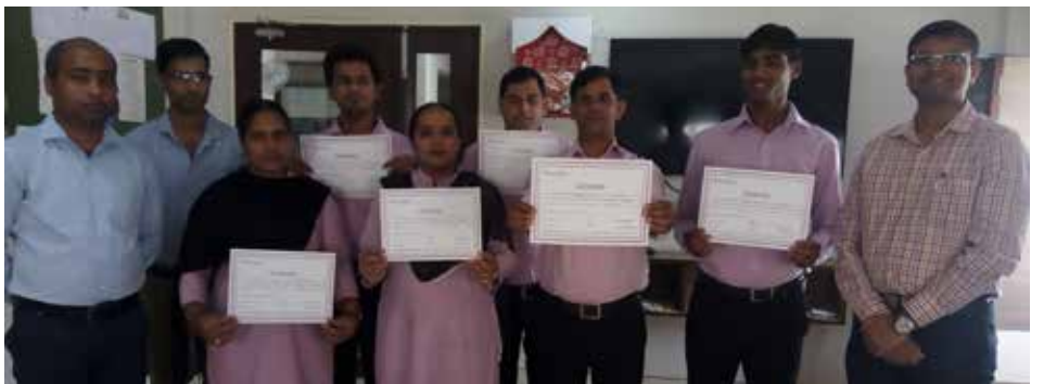
Care Giver certification as a token of appreciation for their wonderful work at Jaipur