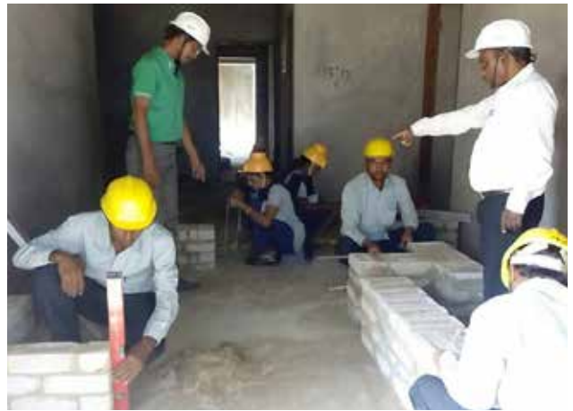
Skill Training batches for masons under CREDAI at Ashiana Tarang, Bhiwadi; and, right, at Gulmohar Gardens, Jaipur

Training and development activities were scheduled throughout the quarter across all departments and at all levels as part of our process of constant improvement.