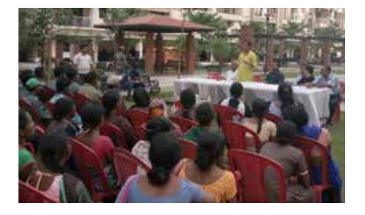
Town Hall Meeting at Anantara, Jamshedpur

forum to understand residents' issues on maintenance and communication was also organised at Ashiana Anantara , Jamshedpur with residents interacting with Estate Officers.