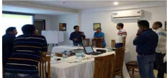
Left: Offsite training for Bhiwadi Estate Officers at Pratapgarh; right: AMS's offsite Annual Manager Training session at Mussoorie